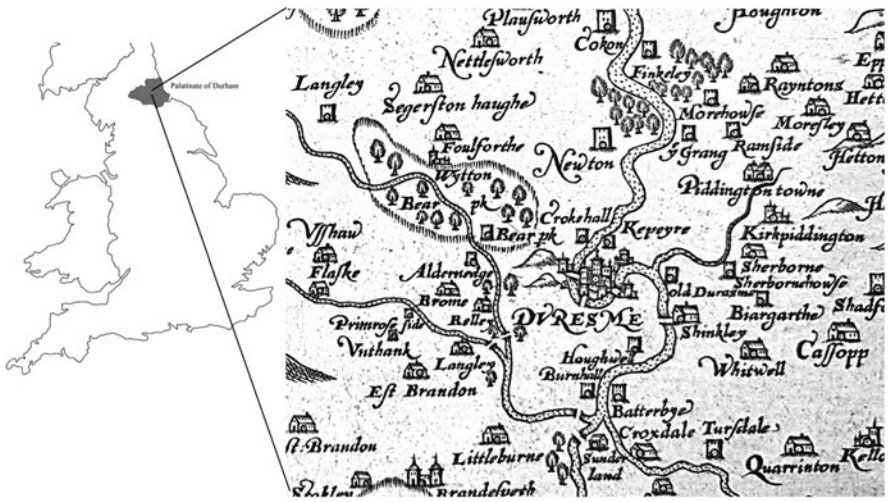
Figure 1. Sixteenth-century map of the Durham region.

Map Key: Duresme = Durham; Bearpark manor and park are depicted as a wooded region to the north-west of the city, surrounded by a palisade; Bearpark moor lay on the two hills between the Old Borough on the western outskirts of Durham city and the park; the coal mines run south of the park and to the west of Durham at Aldernedge = Aldin Grange; Brome = Broom; Relley = Relley; and the dependent cell of Finkle = Finchale Priory lies to the north-east on the River Wear.