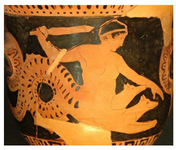
Figure 1. Red-Figure Boeotian Crater (fifth century B.c.) ( LIMC s.v. 'Skylla' I §69). Public Domain Image.