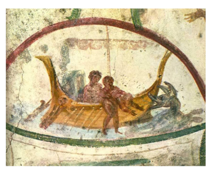
FIGURE 2. Wall Painting of Jonah in the Catacombs of Marcellinus and Peter (second century A.D.). Public Domain Image.

coastlines (HN 9.70).<sup>21</sup> Similarly, the late antique Liber monstrorum mentions creatures in the Mediterranean Sea that are called 'caerulean hounds' ( caeruleos ... canes ),<sup>22</sup> a chromatic detail that aligns well with the sea-green colour of Jonah's \kappa \hat{\eta} \tau o \zeta in the Catacombs of Marcellinus and Peter.