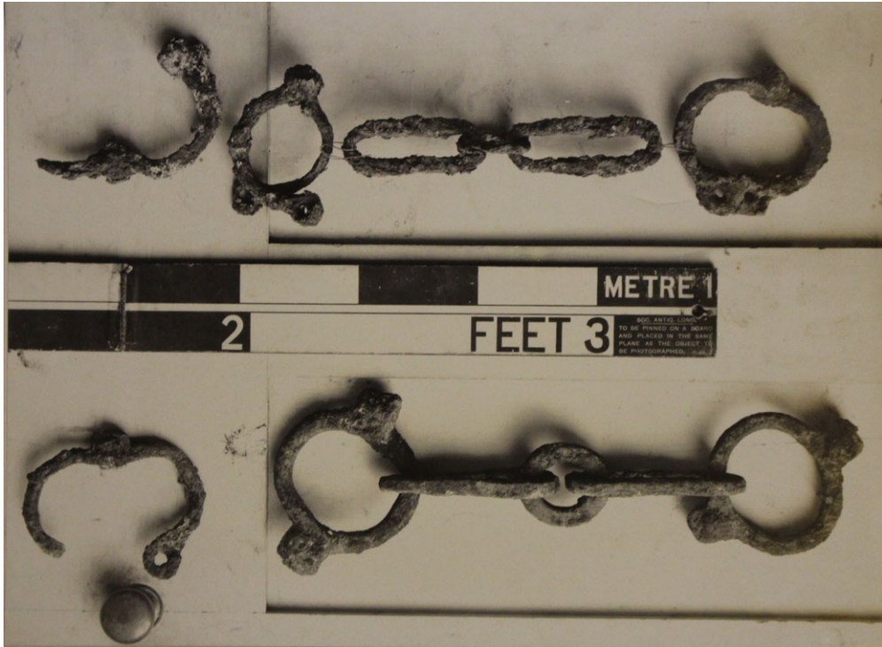
Fig 3. A further two sets of shackles recovered from excavations at Old Sarum, seen in a photograph from D H Montgomerie's Album Accessioned 1936.

incarcerated with the bishop were a number of shackled individuals, some of whose bodies were cast out around the time the bishop himself was exhumed and the cathedral demolition commenced in 1226. How directly the archaeological information presented here might be related to the circumstances of Roger's final days will be returned to below. First, however, the historical setting and what can be gleaned from the various accounts of 1139 will be explored for the information they can contribute to our understanding of the archaeological deposits recovered in May of 1913.