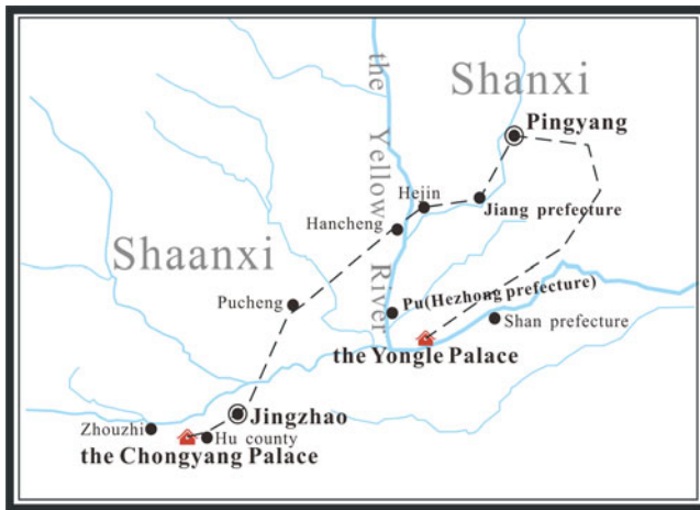
Figure 2. The likely route of the procession of Song Defang's coffin from the Chongyang Palace to the Yongle Palace. Drawing by Yu Kang.

Hezhong prefecture, it seemed unreasonable that the procession continued northward to Jiang (present-day Xinjiang county 新絳縣) and Pingyang (present-day Linfen 臨汾) rather than going straight to the Yongle Palace, unless taking this long way round was a deliberate plan. While the available sources are not sufficient to draw a definitive conclusion about the exact route the procession took, Figure 2 depicts a likely route. 72 The illustration highlights the significant detour the procession made in southern Shanxi.