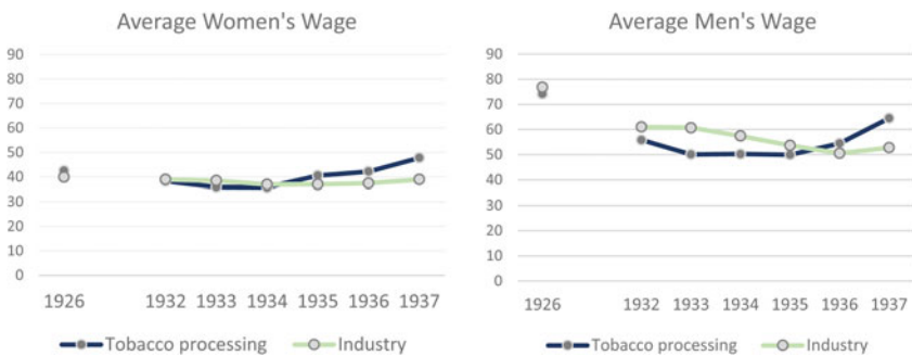
Graph 2. Men's and women's wages in the Bulgarian tobacco industry in comparison with the average industrial wage (lev's per day). 31

a consequence of the collective agreements, but to a lesser extent than men's wages (see Graph 2). Thus, following the introduction of the tonga system in the early 1930s, the gender pay gap in the Bulgarian tobacco industry narrowed significantly: In 1926, women tobacco workers earned, on average, 57.33 percent of a man's wage, while in 1932 it was 68.48 percent. The gender pay gap was smallest just before the introduction of the industry-wide collective agreements in 1935, when women earned an average of 81.25 percent of men's wages. After 1937, the gender pay gap increased to around 74–77 percent (see Graphs 1 and 2).