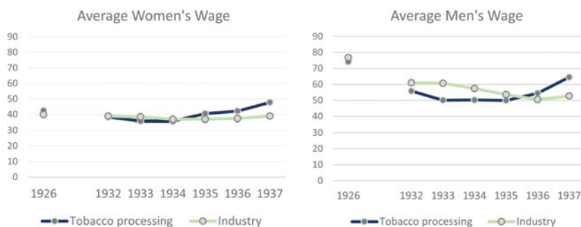
Graph 2. Men's and women's wages in the Bulgarian tobacco industry in comparison with the average industrial wage (levs per day). 31

a consequence of the collective agreements, but to a lesser extent than men's wages (see Graph 2). Thus, following the introduction of the tonga system in the early 1930s, the gender pay gap in the Bulgarian tobacco industry narrowed significantly: In 1926, women tobacco workers earned, on average, 57.33 percent of a man's wage, while in 1932 it was 68.48 percent. The gender pay gap was smallest just before the introduction of the industry-wide collective agreements in 1935, when women earned an average of 81.25 percent of men's wages. After 1937, the gender pay gap increased to around 74–77 percent (see Graphs 1 and 2).