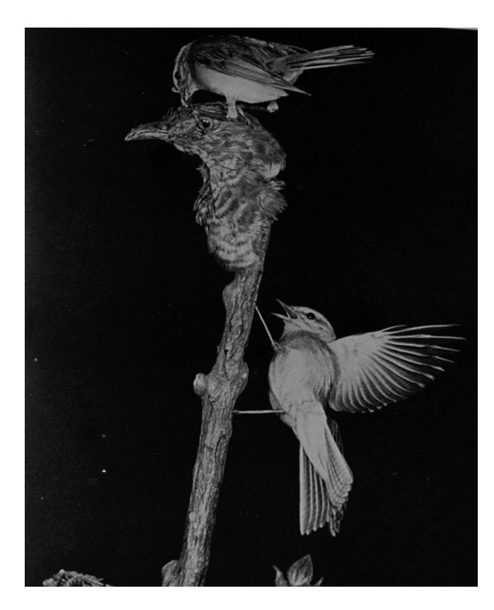
Figure 2. Willow warblers attacking cuckoo head. E. Hosking and S. Smith, Birds Fighting , London: Faber & Faber, 1955.

the map and led to a regular and long-running series on BBC television under the title Look.