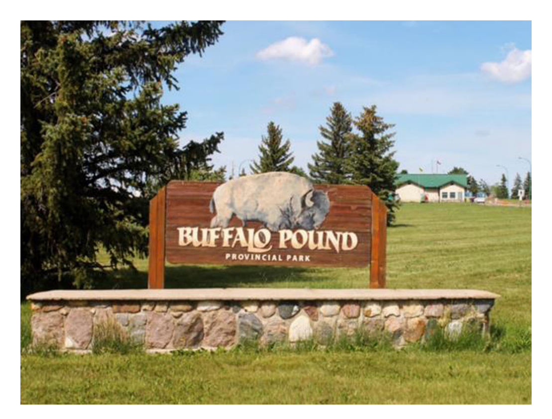
Figure 8. Bison signs.