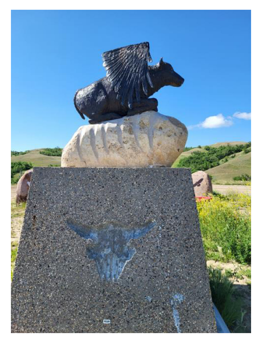
Figure 9. Bison ghosts.

landscape, or their gentle grazing amongst tall prairie grasses alongside the cultural practices of the Cree, Dakota, Dené, Lakota and Saulteaux First Nations of Saskatchewan, were not commensurate with the bustle of Canada-Day fanfare.