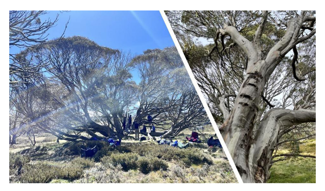
Figure 6. The octopus tree — an ancient tree fighting a new challenge... the longicorn beetle (Jaithmathang Country).