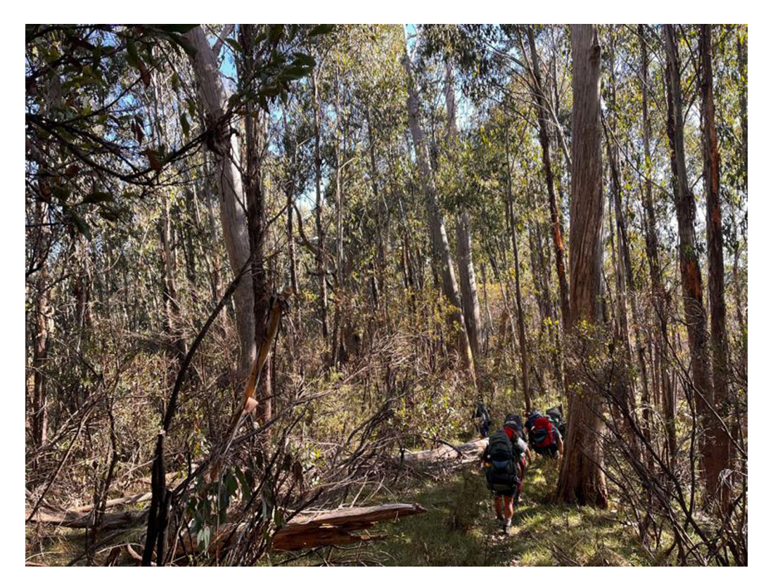
Figure 5. Dense regrowth of Alpine Ash — a more fire prone landscape (Jaithmathang Country).

wetlands in this case). Worldviews collide when the Alps are considered. Many people value the Alps, but for different reasons; commodity, resource, wilderness, recreational amenity, home, kinscape and much more. The Alps are a boiling pot, mixing together biological processes and enduring material manifestations of colonial and capitalist pressures, all with a natural facade. But there is hope in these mountains, too, with people caring, acting and fighting for them in numerous ways (e.g., passionate activists, land managers, fire fighters, educators and more, performing little acts of care every day).