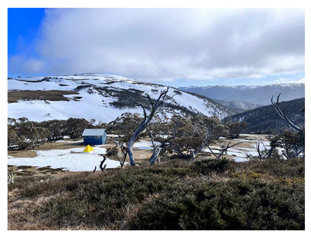
Figure 1. Questionable backcountry skiing conditions in late Winter, 2023. (Jaithmathang Country).