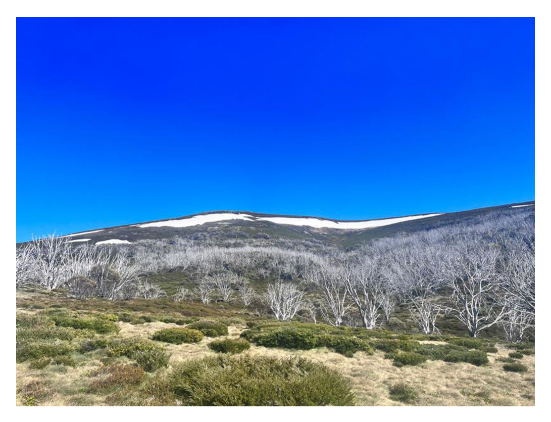
Figure 4. A snow patch and recovering snow gums under Mount Nelse (Jaithmathang Country).

The same also goes for surrounding shrubbery, leaving ghost forests, invasive grasses and a landscape less able to retain snow. Possibly worst of all, is that in these particular forests, with these types of trees, older forests produce less fire, but more fire leads to more fire (Zylstra, 2013). Rose's (2012) concept of double death resonates here, where it is not just death of an individual, but also death of ongoingness and the ability for an ecological collective to regenerate itself.