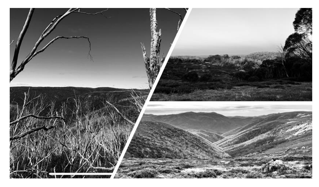
Figure 2. 'Ghost forests' across the Australian Alps. (Jaithmathang Country).