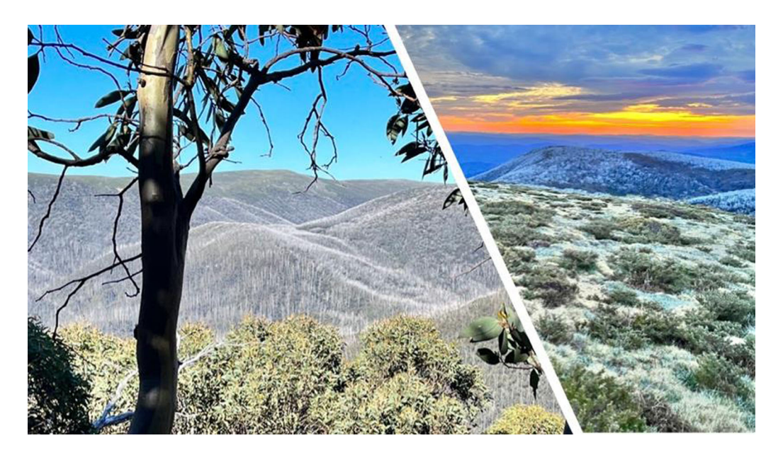
Figure 3. Snow gums near Mount Bogong/Warkwoolowler burned in the 2003 fires (right) and looking eastward from near Falls Creek (left). (Jaithmathang Country).

because, although snow gums have adapted to fire, they are not well adapted to multiple fires in quick succession. As Fairman et al. (2017) explain, snow gum limbs will often die in a fire, but they regrow from lignotubers (their bulbous bases where energy reserves are kept and where buds lie dormant), starting again with small shoots (e.g. see Figure 4). However, multiple fires in quick succession kill off lignotuberous growth, ultimately killing the tree. Furthering this issue, new seedlings may regenerate after one fire, but are killed off after multiple fires in quick succession.