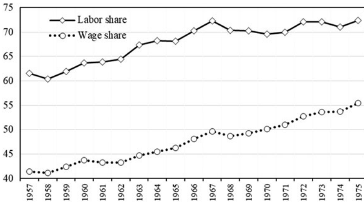
Figure 1. Evolution of the labor share and the wage share (1957–1975)

Notes: The wage share is the compensation of employees as a percentage of GDP at the cost factor. It includes wage payments for self-employed workers.