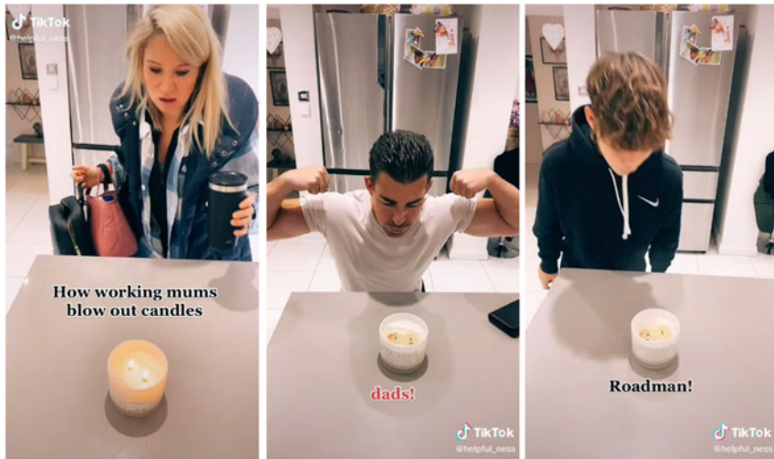
FIGURE 3. 'How do you blow out a candle? Ask the family too?.'

This linguistic stylisation draws on numerous aspects of MLE, including the lexis fam , ahlie , the DP marker styll , and MLE vocalic and consonantal features. These features co-occur with a dramatically marked monotonic pitch and the swear-word fucking , which together evoke an aggressively confrontational stance. This stance is ideologically linked to the hypermasculinity that characterises the roadman and is strategically deployed to command the imagined addressee to clean their room.