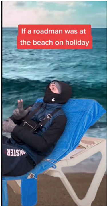
FIGURE 1. ‘If a roadman was at the beach on holiday’.

utilises cinematographic features such as voice modifiers, (unusual) props (e.g. a towel for hair), green-screen backgrounds, and other theatrical elements to ‘frame’ the performance. I refer to this type of performance as ‘theatrical stylisations’. Common to this category of video is that the roadman appears in hypothetical comedic situations, such as when he ‘goes to parents evening’ or ‘becomes a bus driver’. Examples are Figures 1 and 2 , where the roadman is recorded in two comedic vignettes: first, whilst he is at the beach on holiday, and second, whilst babysitting.