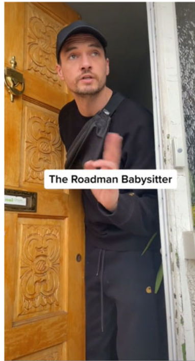
FIGURE 2. ‘The roadman babysitter’.

In these examples, the roadman is performed through an assemblage of semiotic resources. First, he is depicted in ‘streetwear’ attire (e.g. tracksuit, padded jacket), wearing fashionable athletic designer brands such as Nike, Adidas, and Reebok (see also Gunter 2008). This aesthetic appears to be maintained regardless of the weather conditions of the scene, such as in Figure 1 where the roadman is depicted relaxing on a beach on a summer’s day dressed in clothing typically suited to the winter (e.g. jumper, puffer jacket, sweatpants, face mask).