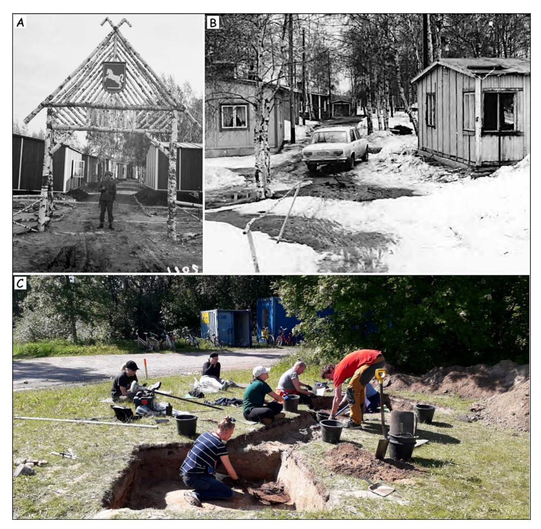
Figure 2. A) German soldier standing guard in Vaakunakylä during the war; B) Vaakunakylä in the early 1980s; C) field-school participants excavating the wartime horse-stable foundations at Vaakunakylä.

therefore, the Vaakunakylä barracks were preserved. In the late 1940s, Finns who were left homeless by the war moved into the barracks (Figure 2).