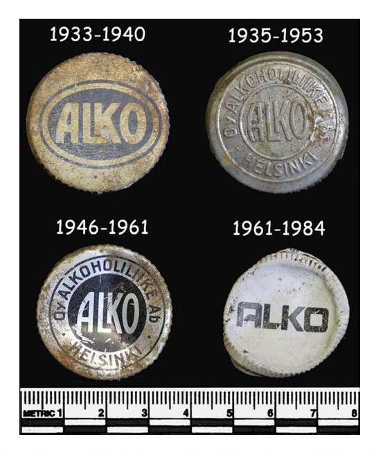
Figure 6. The 'bottle-top chronology' with finds from Vaakunakylä.

but, based on our contemporary archaeological explorations, alcohol bottle tops are among the most common finds in all twentieth-century contexts in Finland. We can trace what was consumed in different households based on the bottle tops and they also serve as horizon markers. We have established in our research a 'bottle-top chronology' based on the finds from Vaakunakylä that works as a tool for dating twentieth-century sites across Finland (Kelloniemi 2023) (Figure 6).