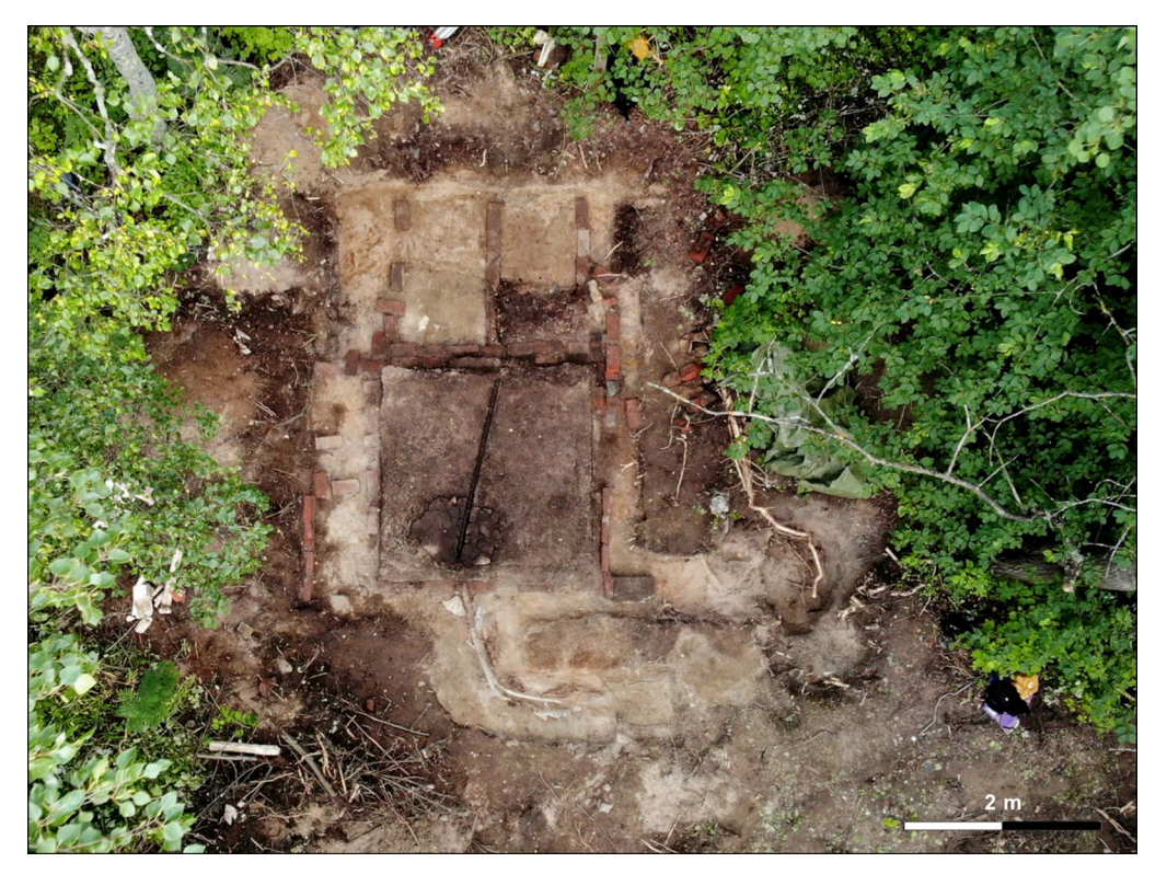
Figure 3. Foundations of a German laundry barrack turned into a sauna (photograph by authors).

philosophy, where nature became viewed as a commodity for public consumption (Matila et al. 2021). Also, the stigma attributed to Vaakunakylä of co-operating with the Nazis did not help. The City of Oulu had already taken measures to conceal the last reminders of Nazi past from the local landscape (Ylimaunu et al. 2013).