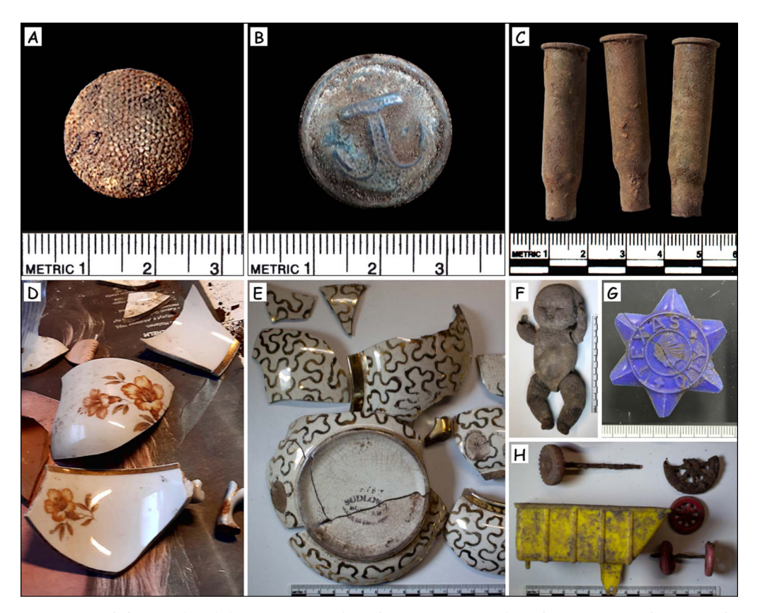
Figure 5. Finds from Vaakunakylä. A) German military button; B) Soviet military button; C) cartridges; D) Arabia Myrna cup fragments; E) fragments of a Sudlow's teapot; F–H) toys.

Numerous rubbish pits located in the area helped in reconstructing day-to-day family life. Only a few wartime finds were made, which is understandable as the Germans were in the area only for a couple of years and Finns lived there for four decades (Figure 5A–C). Pits contained mostly household waste, as there was no municipal garbage management in Vaakunakylä, which indicated variation between households in terms of possessions. For instance, sherds of high-end porcelain sets (Figure 5D & E) suggest that at least some Vaakunakylä residents could afford non-essential commodities to improve their living standards. Based on finds and recollections, locals took pride in their living spaces and were comfortable enough to entertain guests, which contrasts clearly with outsiders' low opinions of poorer areas.