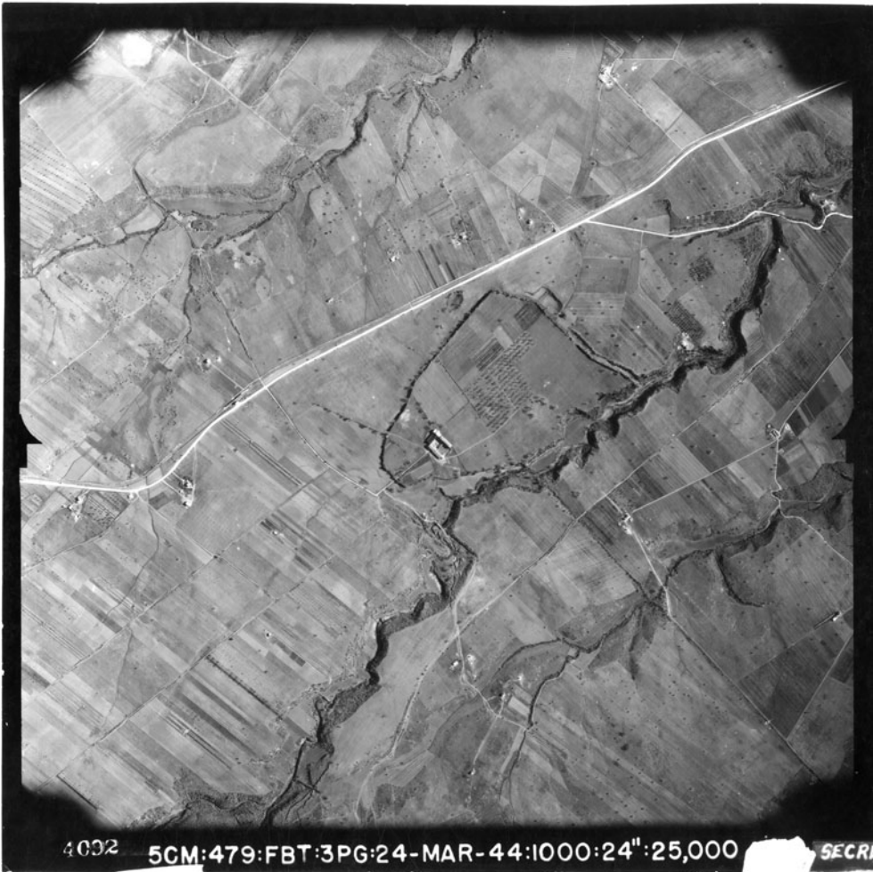
Fig. 2. Aerial photograph taken over Falerii Novi by the Royal Air Force on 24 March 1944. The outline of the city-walls is clearly visible along with the Rio Purgatorio valley (Reproduced from the Aerofototeca Nazionale Archive, Rome: RAF_1944_143_55_4092_56813_0).

From 1969 to 1975, the eastern half of insula XXXI (as defined in Keay et al., 2000, and by FNP as ‘Area 4’) to the east of the church of Santa Maria di Falleri was excavated by the Soprintendenza. The area opened by these excavations remains visible today (Fig. 3.1). Investigations exposed an intersection of the main east–west and north–south street axis (the so-called decumanus maximus and the Via Amerina), as well as a large complex built in opus quadratum immediately west of the forum’s southwestern flank, as identified by geophysical survey (cf. Keay et al., 2000; Verdonck et al., 2020). Only minor details of these excavations are published (Brunetti Nardi, 1972, 1981; De Lucia Brolli, 1995–6). Further work in this area was conducted by the Soprintendenza in 1989, at the northern and southern end of the excavated