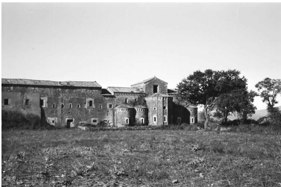
Fig. 4. Photo of the church and adjoining abbey of Santa Maria di Falleri, taken by John Ward-Perkins c. 1957 (BSR Photographic Archive, John Bryan Ward-Perkins Collection, wpset-0295.06).

Emblematic of the FNP's interests, in the summer of 2022, the first year of full excavation saw three trenches opened at Falerii Novi (Andrews et al., 2023; for locations, see Fig. 3). The first was located over a macellum structure between the forum and Santa Maria di Falleri (Area 1) (Fig. 4), the second explored a domus south of the forum area (Area 2), and the third a multifunction streetside intersection along the Via Amerina one block inside the south gate (Area 3), which contained possible shops, domestic structures, paved stretches of a secondary east–west side road, and the wider Via Amerina itself. The previously excavated insula XXXI (Area 4) was also subject to structural recording as described above, although no excavation was undertaken. This selection represented a desire to collect material stratigraphically from a range of urban spaces that take us beyond a limited selection of elite monuments and thus reveal a more ecumenical understanding of urban lifeways.