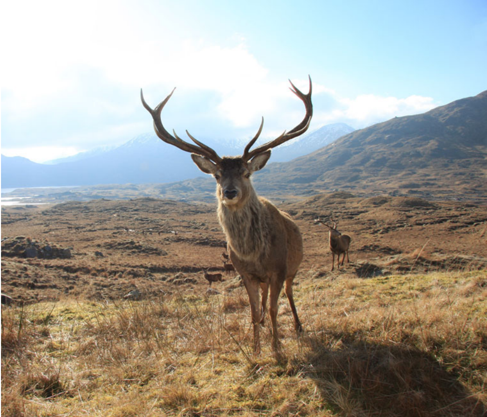
Figure 2. Red deer ( https://depositphotos.com/ – royalty free stock photos).

quoting Cummins (1988: 41): ‘There was a recognised way of doing everything: formulaic cries, commands and horn-calls; ritualised ceremonies. The most striking imposition of ceremonial and activities [...] came after the death, in the flaying and butchering (“unmaking” [...]) of the animal.’ Cummins’ account of this unmaking is based on textual and iconographic sources, the latter relying especially on the pictorial representations included in Le livre de chasse de Gaston Phébus (late fourteenth century, south-western France). This includes key images of the hart held on its back while butchered and skinned (BNF, MS. fr 616, fol. 85). A similar image is also represented in the approximately contemporary Livre du roy Modus