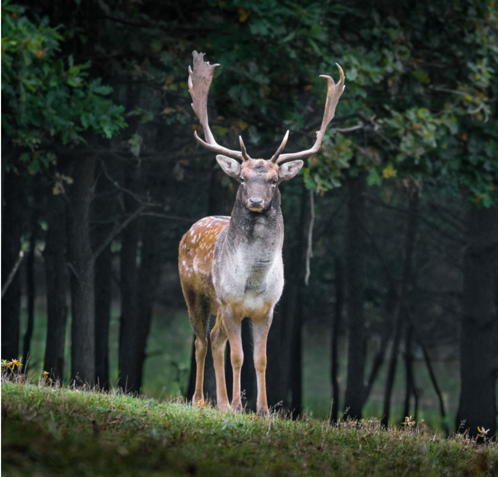
Figure 3. Fallow deer.

on the instructions provided by different hunting manuals. The butchery process that led to the separation of these different cuts generally took place on the spot, but in some cases the carcass was carried whole to the hunting lodge before dismemberment (Cummins, 1988: 42). It is somewhat surprising that the pelvis was thrown away as it potentially carries a substantial amount of flesh ( contra Cummins, 1988: 42) but, presumably, it was detached from the body in such a way that only a limited amount of meat was wasted—unless feeding the corvids represented an important part of the ritual.