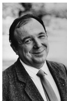
Jean-Pierre Changeux Collège de France Neurobiologist