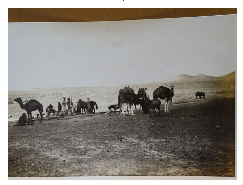
Figure 1. The wells of Tal al-Milh village (Wadi al-Malah-al-Meshash) during the 1880s.

goats, barley, sheep, camels, tobacco and milk products'.<sup>30</sup> There was, in other words, a significant degree of what Peter Taylor calls 'town-ness' here before there was density, city planning or monumental buildings – and there was 'city-ness' at work before there were railroads and the telegraph, materializing Bir al-Saba' as a central connected place of imagined possibilities, mobility and stability.<sup>31</sup>