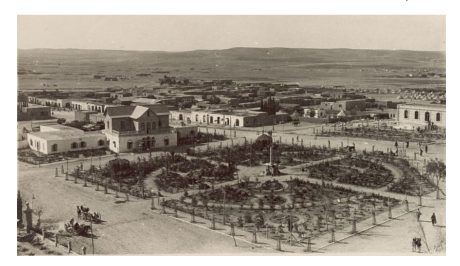
Figure 2. Bir al-Saba' during the Ottoman rule.