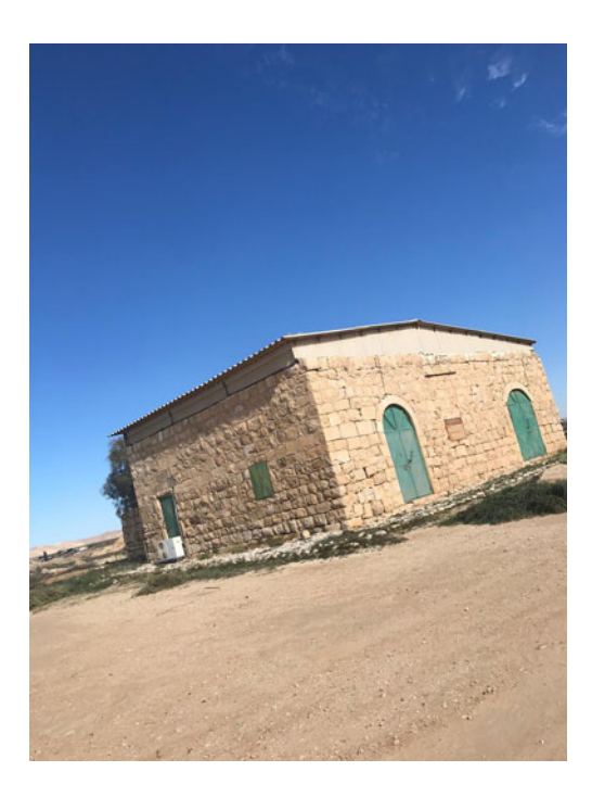
Figure 4. The flour mill of the village of Tal al-Milh (al-Malah) during the British rule in Palestine.

and other Bedouin villages like Tal al-Milh and 'Ara'ara' (see Figure 4). <sup>127</sup> Saba'awi agency deepened regional economic ties through their purchasing and productive power 'in the markets of Hebron, Gaza and Bir al-Saba''. <sup>128</sup>