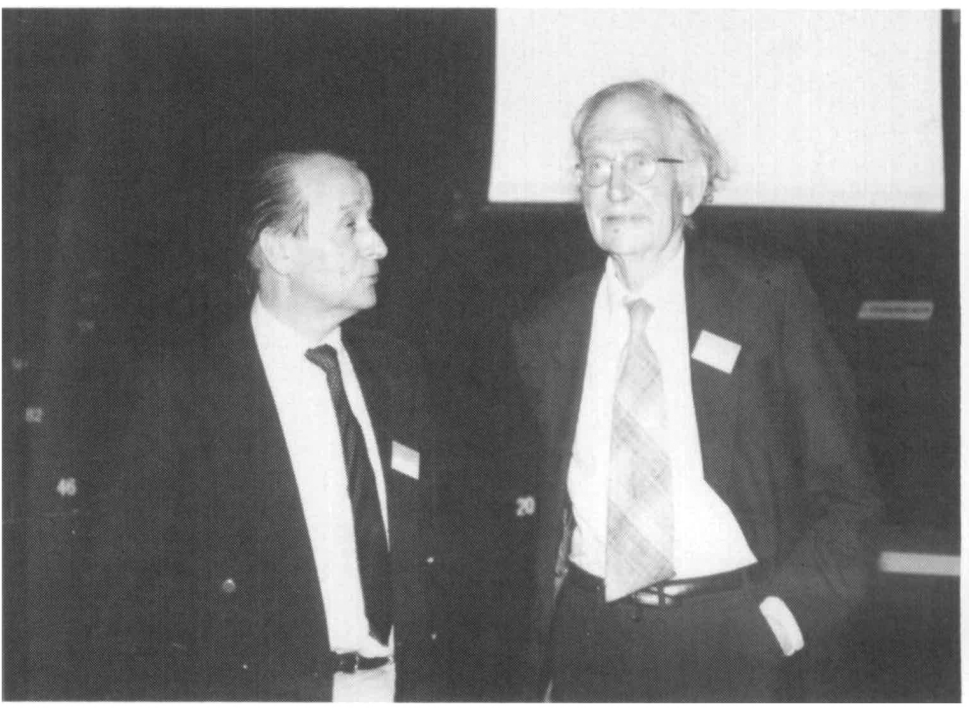
P. Siffert (left), Interim President of E-MRS greets Nobel Laureate Nevill Mott before plenary session begins.

isms. Recent work using isotopically enriched oxygen-18 has shown that, for dryoxygen oxidation of silicon, the oxygen moves through the film to the interface with silicon where new oxide is formed without exchange with the oxygen already bound in oxide. Water vapor, on the other hand, moves through the oxide so as to exchange with extant oxygen. Precise transport mechanisms in this case are still unclear.