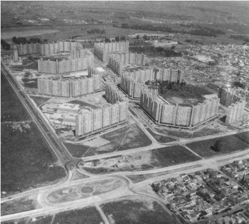
Figure 3: The construction of Villa Lugano I and II, Buenos Aires, c. 1971. The innovative urban and architectural design, taken ‘from the ideas of the TEAM X, was completely alien to Buenos Aires urban culture. Parque Almirante Brown – Conjunto Urbano Lugano I–II’; Municipalidad de la Ciudad de Buenos Aires, c. 1971.

and social facilities including schools, health posts, day-care centres, a commercial centre, playgrounds, churches and public offices. Envisaging the progressive development of the neighbourhood, the urbanization of the area also implied heavy investment in complex and basic infrastructure like running sewerage and water systems – including the channelling of the Cildañez Creek, connection to gas and electric power and telephone services.