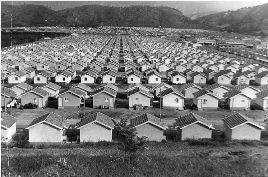
Figure 1: Vila Kennedy, Rio de Janeiro, c. 1965. The State of Guanabara built this housing development with the economic and technical assistance of the US Agency for International Development (AID) in the context of the Alliance for Progress. COHAB-GB, A COHAB através de números e imagens (Rio de Janeiro, 1965).

failed to materialize. Transportation services to other parts of the city remained notoriously poor. At the same time, the areas in central Rio that experienced slum eradication fell under the gaze of large-scale real-estate interests, including the Hilton Hotel Corporation, who agreed to pay $8 million to Guanabara State for rights to construct a 350-room hotel tower on the Morro do Pasmado, overlooking scenic Guanabara Bay. 23