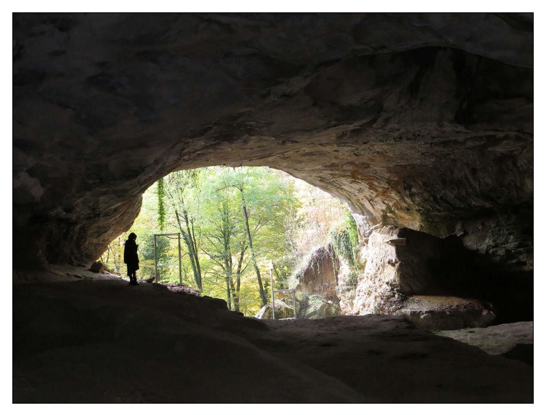
Figure 2. Vindija cave.

Upper Palaeolithic interface in Vindija, specifically regarding the large discrepancies in direct dates of Neanderthal remains (see Devièse et al. 2017 and references therein).