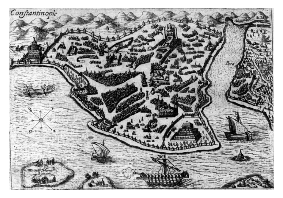
Figure 1. Pictorial map 'Constantinople'. Henry Beauvau, Relation iornaliere du voyage du Levant (Nancy: Iacob Garnich, 1615), 48.

covering the entire Golden Horn and most of the Bosphorus. Another remarkable point in Beauvau's map is that it depicts Istanbul in clusters, reflecting the city's early modern morphology; it then consisted of various spatial clusters or units such as neighbourhoods, palaces, monumental buildings and social complexes, as Beauvau had clearly visualized.