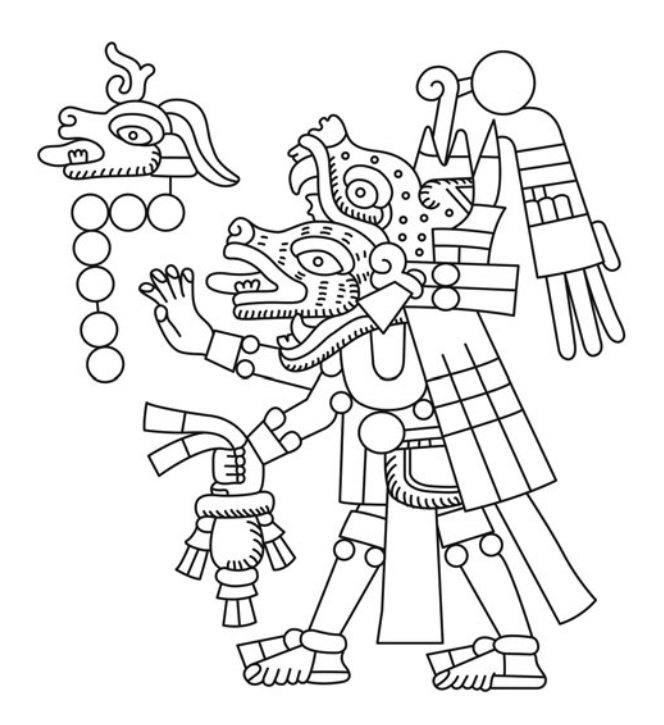
Figure 2. Lord 7-Deer from Codex Vindobonenesis , obverse, f. 4 (Illustration: Mitzy Reyes Juárez).

Owl: ʃiwaã~tʃiwau~kuʃiwaã~kuʃuwaã from the day name "13-House"