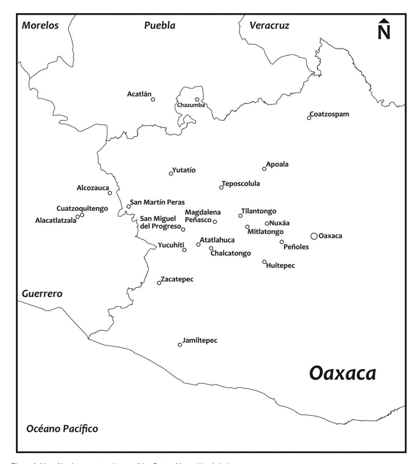
Figure 1. Map of localities mentioned in text (Map: Enrique Montes Hernández).

of the different Mixtec varieties included in this study. Some varieties, such as Alcozauca and Nuxáa, have received in-depth phonological descriptions (McKendry 2013; Mendoza Ruiz, in preparation), whereas other varieties have almost no prior study. These descriptive differences are most apparent in the treatment of tone, which is contrastive in all Mixtec varieties. When tone is known, high tone is indicated with an acute accent ( \hat{a} ), mid tone with a macron ( \bar{a} ), and low tone with a grave accent ( \hat{a} ). Unassociated tones that provoke