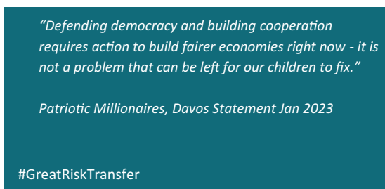
Figure 2. Patriotic Millionaires, Davos statement January 2023.

Figure 2 has a quote from the Patriotic Millionaires.