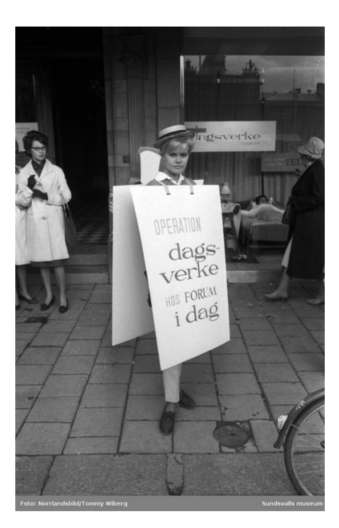
Figure 1. Student supporting the OD campaign in Sundsvall, 15 September 1961.

name, meaning 'day' in Swedish), where participants also donated one day's earnings to the Dag Hammarskjöld Foundation. Later that year, Sveriges Ungdomsorganisationers Landsråd, the National Council of Swedish Youth Organisations (SUL), announced its plans for a national Operation Day's Work campaign, adopting the Alnarp students' slogan. In the end, the campaign made use of the mottos 'En dag för Dag' and 'Operation Dagsverke', citing the latter as the preferred method of fundraising. In December 1961, SUL distributed a call for this nationwide fundraising campaign to all its member organisations, stating that Swedish youth looked to the legacy of Hammarskjöld and his 'super-human contributions' as an inspiration. It urged members to donate one day's salary to the fund.