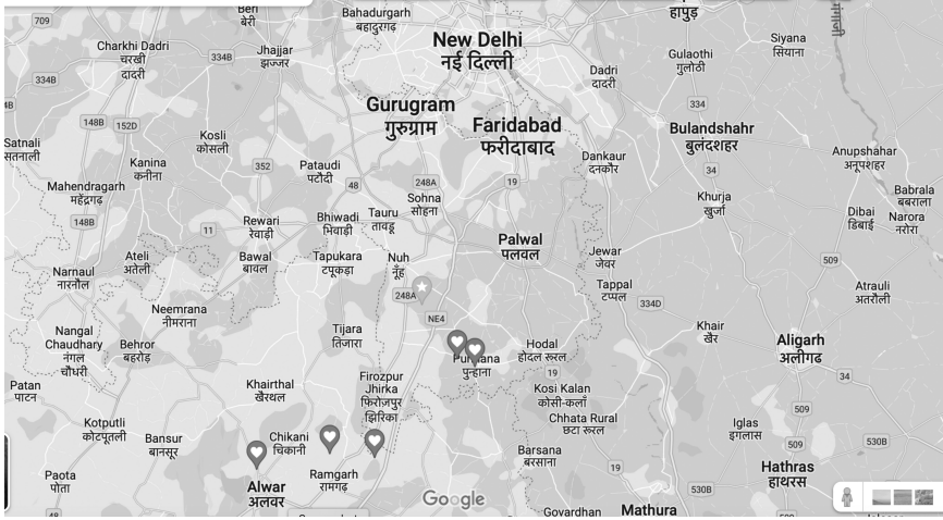
MAP 3 The traditional shrines of Laldas and other field sites